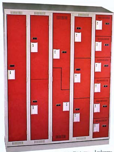
Single Tier Double Tier Portoclub Triple Tier Lockette

Anthony Steel Clean-Line Lockers are the result of over 20 years of manufacturing experience. ASM Clean-Line Lockers are designed to provide strength & durability in even the most demanding environments.